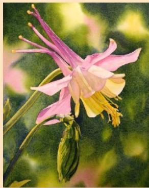
Columbine Demo