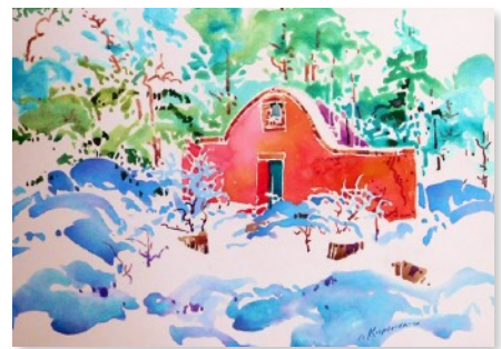
"Mission Arch-Root Cellar"