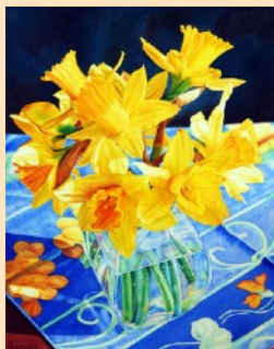
"Spring in Provence"