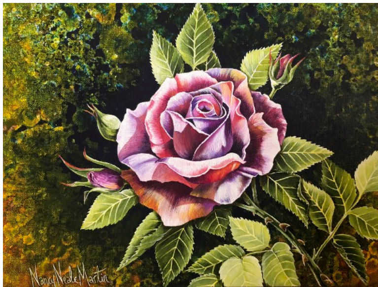
"Just as Sweet"