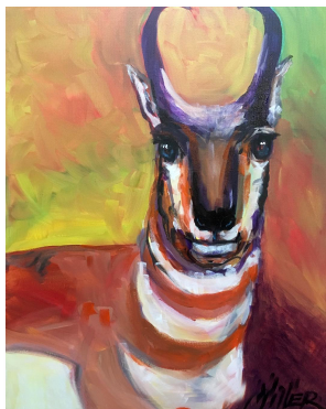
"Prairie Runner" Acrylic on Canvas Finished Pronghorn Demo