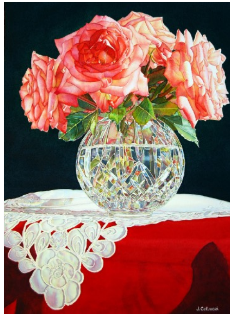
"Crystal in Full Bloom"