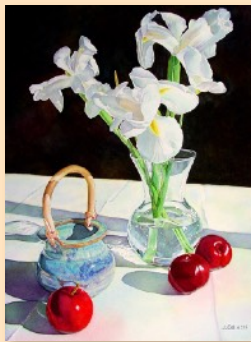
"Still Life with Plums"