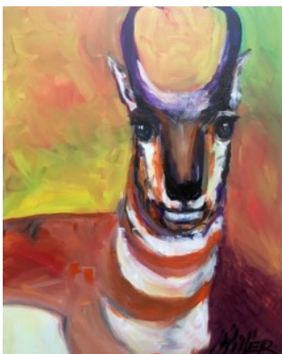
"Prairie Runner" Acrylic on Canvas Finished Pronghorn Demo