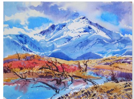
"Winter Reflections-Pikes Peak" ©Buffalo Kaplinski