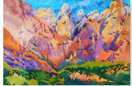
"Court of the Patriarchs-Zion National Park" ©Buffalo Kaplinski

Visit his website at: www.buffalowatercolors.com