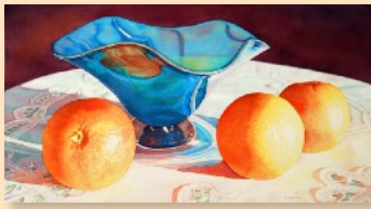
"Blue Glass & Oranges"