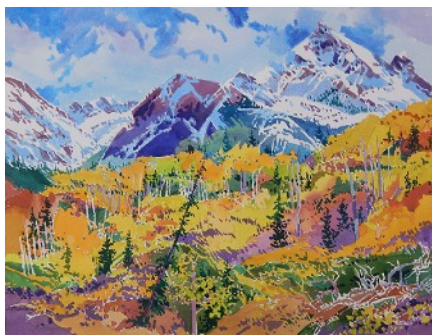
"Buckskin Pass"

Show Award for his painting "Buckskin Pass."